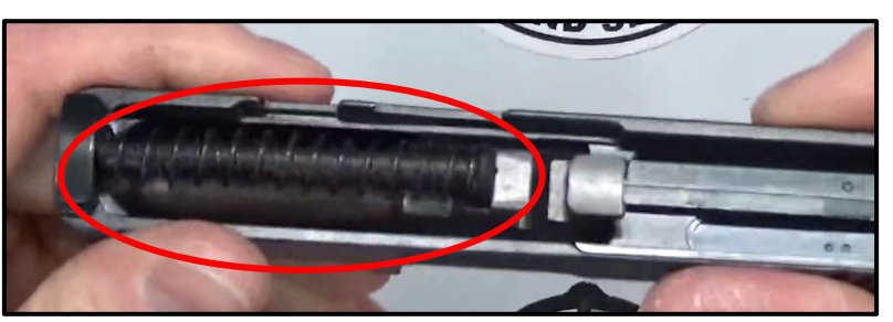
Step 6: Get your M*CARBO Stainless steel Guide Rod and Recoil Spring, and place the guide rod in the spring